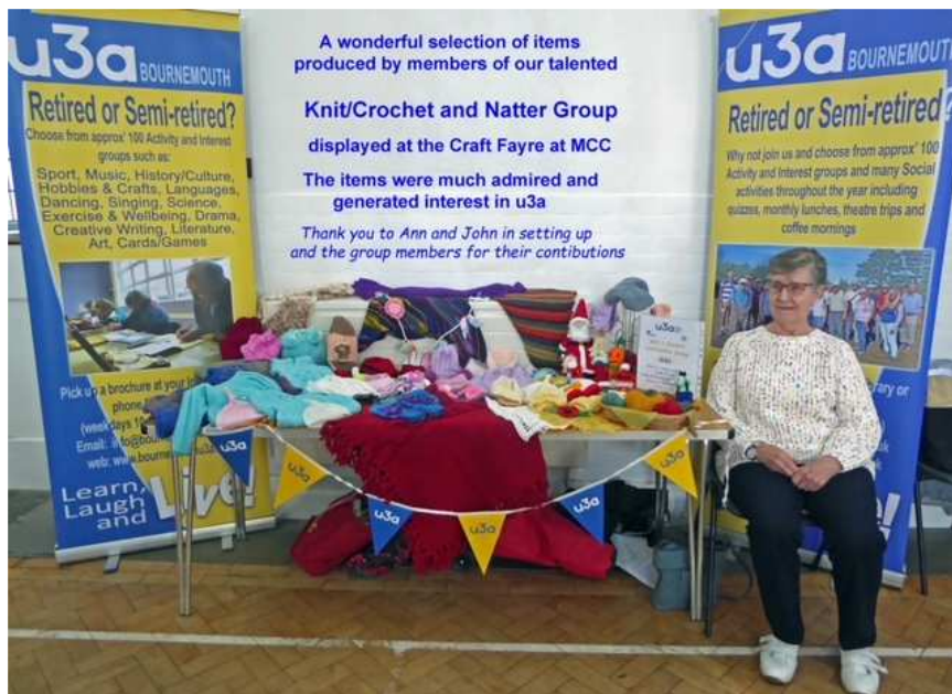
The Knit/Crochet and Natter Group No. 95 had a colourful Stand at the Moordown Community Centre Craft Fair held on 28th October 2023.